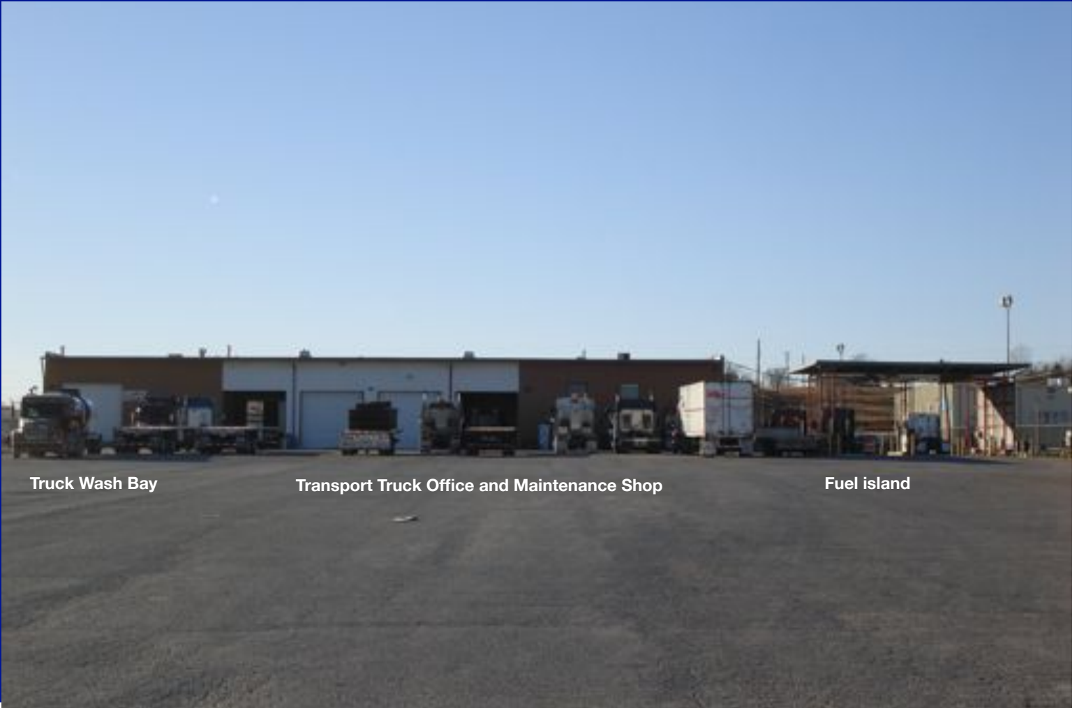
Truck Wash Bay